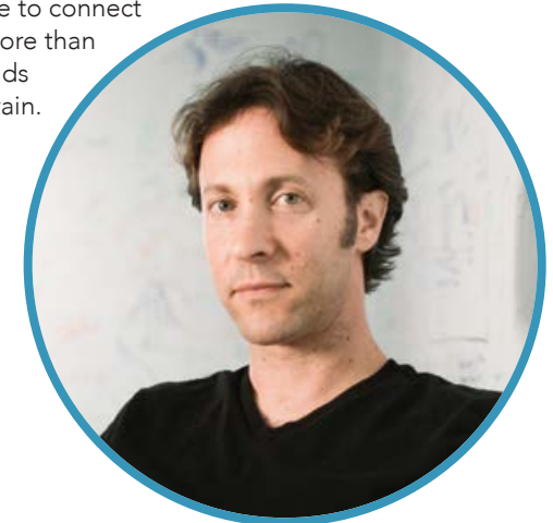
Dr. David Eagleman sitting in his lab—the Laboratory for Perception and Action at the Baylor College of Medicine

The American Brain Foundation became a sponsoring partner of the six-part PBS television series “The Brain with Dr. David Eagleman,” which aired in October 2015. Eagleman is a neuroscientist, Guggenheim Fellow, and New York Times best-selling author. In the series, he employs an array of visual effects to take viewers on a journey inside the brain to demonstrate its complexities and how it works to give definition to who we are. By aligning with this show, the Foundation was able to connect with and educate more than 2.7 million households about the human brain.